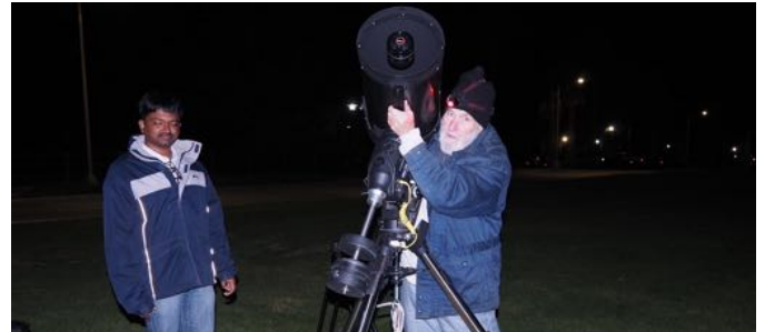
“I’ll wake him up with an unfiltered view of the Full Moon with this baby!”

The bottle method counts the number of neutrons per time, while the beam method counts the number of protons produced by neutron decay per time. They should give the same result unless there a new process or particle involved. The speculation de jour is of course that neutron decay also produces a dark matter particle in an unknown process that takes 8 seconds to occur.