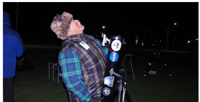
“This is the last time I set up under a pelican’s nest....”