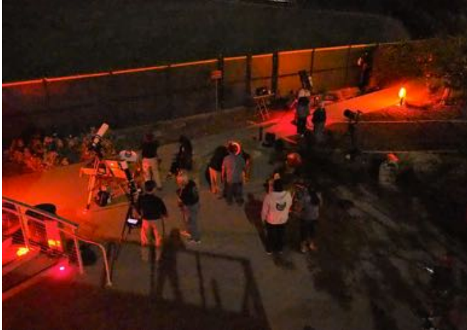
The public gathers at the Westmont Observatory for a "Third Friday" outreach.

Sponsored by the Santa Barbara Museum of Natural History