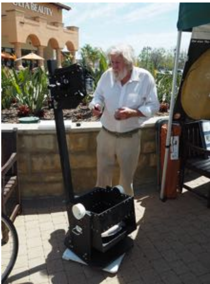
“That’s right. If you remove the mirror, it makes a great washtub.”