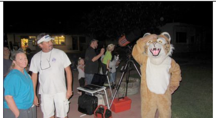
"I understand this often happens when he stares at the moon through Chuck's scope."