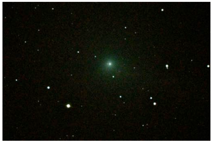
Comet Johnson. Imaged by Bruce Murdock on 5/19/2017.