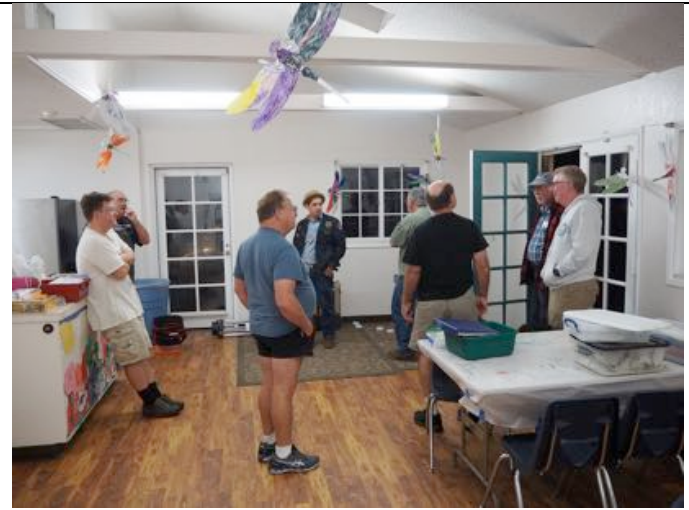
"Who left the door open and let these monsters in?!"

Sponsored by the Santa Barbara Museum of Natural History