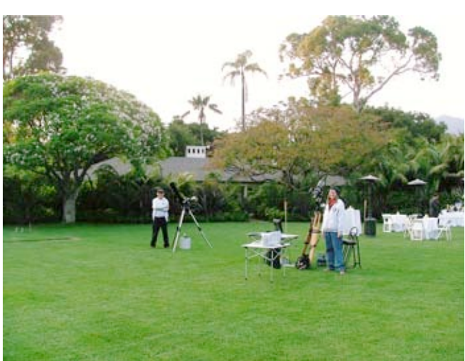
What an elegant setting to view the stars!

Arrangements weren't finalized by press time, but we may have some Sunday events at the Bacara Resort and Spa. Details in a future email, or contact Chuck.