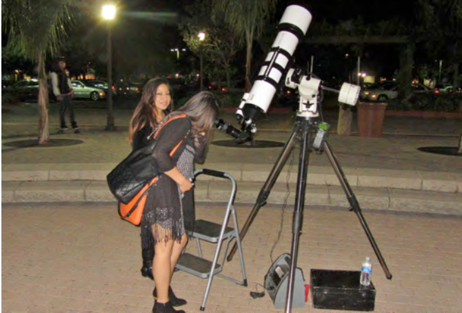
A couple of star-gazers enjoy a look at the Moon at the Camino Real Market Place.

Sponsored by the Santa Barbara Museum of Natural History