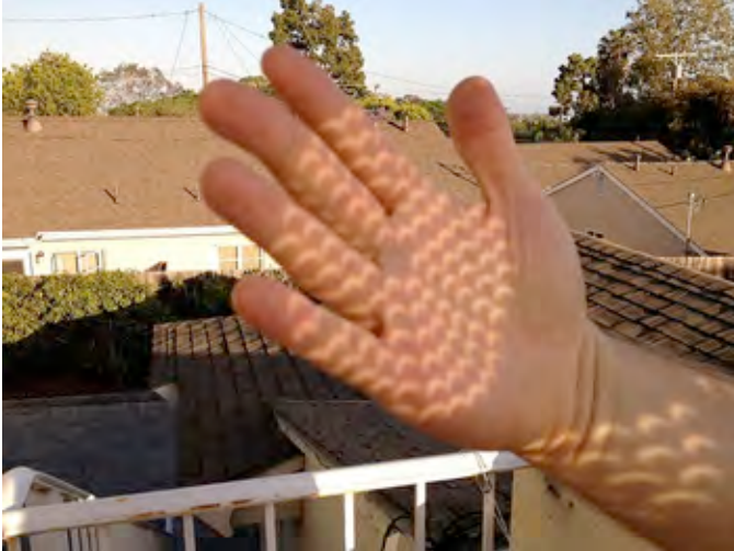
Dmitrii Zagorodnov demonstrates how to capture multiple images of the recent solar eclipse using a kitchen colander.

Sponsored by the Santa Barbara Museum of Natural History