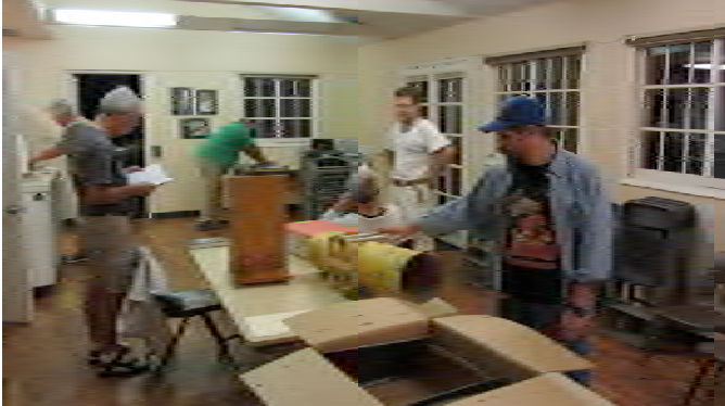
A busy evening at the mirror-making workshop.

Sponsored by the Santa Barbara Museum of Natural History