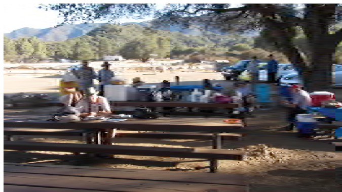
"Hmmm.... Let's see. I think I'll be able to crack this Arp Galaxy Group by about midnight..."

Telescopes for Bacara Resort and Spa. We set up on their Miró Lawn.