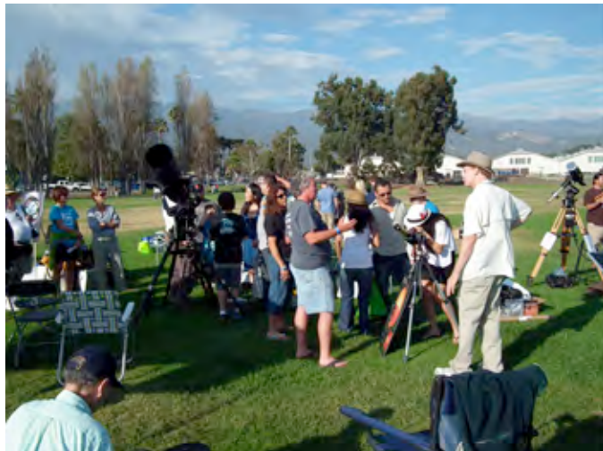
A gathering of stars at the Avocado Festival in Carpinteria this past October.