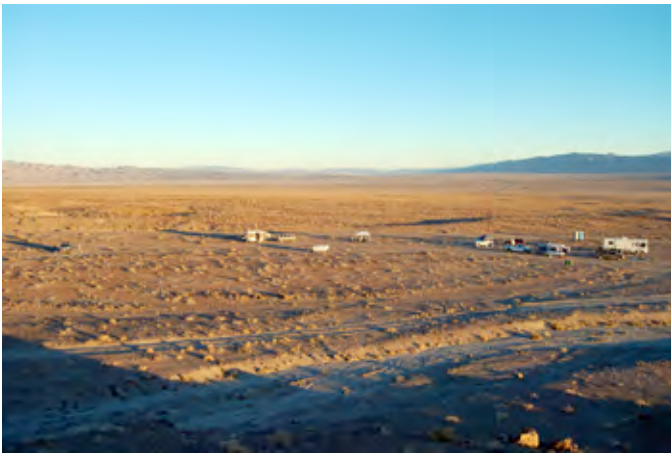
View of the Nevada Central Star Party.

in from California for as little as one night. About half of the people spent the night imaging, the other half had mostly Dobsonians, ranging from 8 to 16 inches. I spent a little time trying to see how dim a star I could see unaided in the Little Dipper, using the Northern polar sequence of star magnitudes. I was consistently able to make out a 6.4 magnitude star in the bowl of the Little Dipper, and occasionally I could see a 7.1 magnitude star near Polaris. Everyone seemed to have a very good time. Dark adaptation was preserved for everyone, and many fine views were shared. I stayed up till 2 AM the next two nights, spending quite a bit of time observing with new friends, one of whom saw 20 bighorn sheep that day a couple of miles away from the site. I plan to go next year, and hopefully I will see some bighorns then as well.