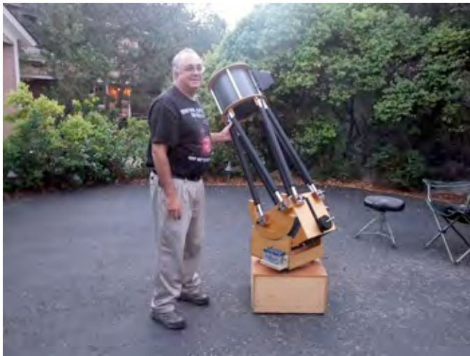
Standing proud at a SBMNH outreach.

Monthly Public Telescope Night at Westmont College, at the new observatory next to the baseball field.