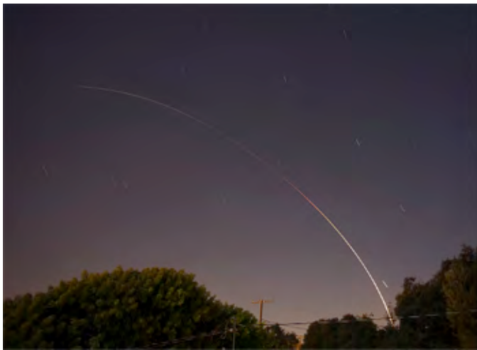
Summer Vandenberg Launch.