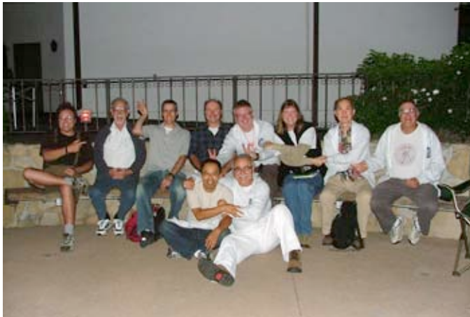
Although clouded-out at September's SBMNH outreach, AU outreachies are all smiles!