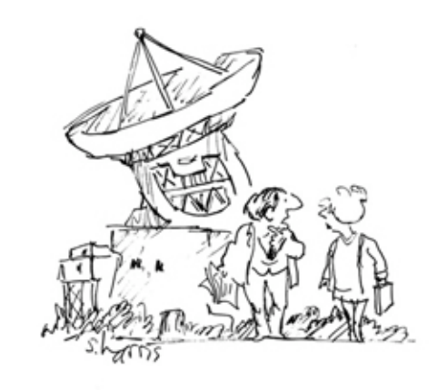
"One advantage of living near a binary star would be a sun tan in half the time."

Telescopes for the kids at Los Padres National Forest Family Camp, at Paradise Campground along the Santa Ynez River.