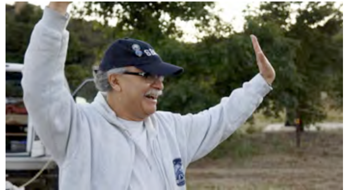
"I give up! How many astronomers does it take to screw in a light bulb?"