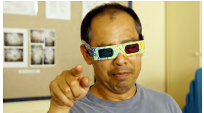
"Resistance is futile."