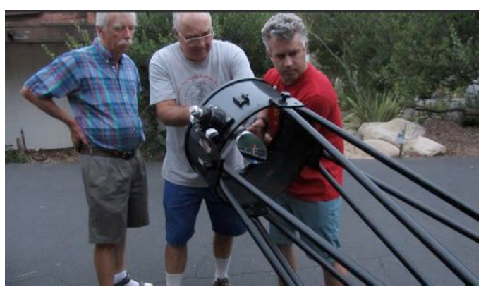
"Anybody have a hammer and chisel?"

FRIDAY, SEPTEMBER 30, SETUP 7 PM Telescope Night for a group of STEM students at Westmont College, at the observatory, adjacent to the baseball field.