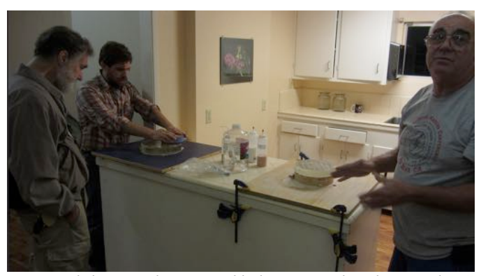
"Wait 'til they see that I sprinkled some sand in their pitch....'

Each star in the cluster is in a slightly different orbit around the galactic core and as time passes they slowly drift apart and the star cluster dissipates. There is a research project underway to try to locate stars that were once in the cluster with our sun and condensed out of the same nebula. It goes like this: we know how old our sun is and we know its orbit in the galaxy, so we can backtrack to find the location of our sun when it formed. Other stars are located which have similar luminosity, mass and spectral properties to our sun and their orbits are determined and backtracked to where they were formed. If it's a match, a sister star to our own has been located. One star has so far matched. It is HD 162826, 110 light years away located in Hercules. It's not a twin of our sun, but a sibling. It's 15% more massive than our sun.