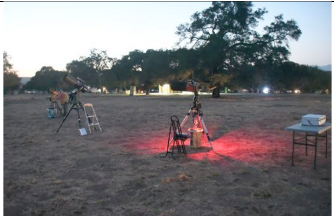
Readied for the next lucky viewer.